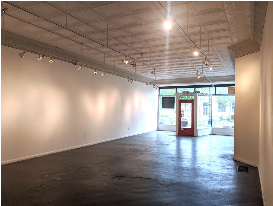
Empty gallery, back to front