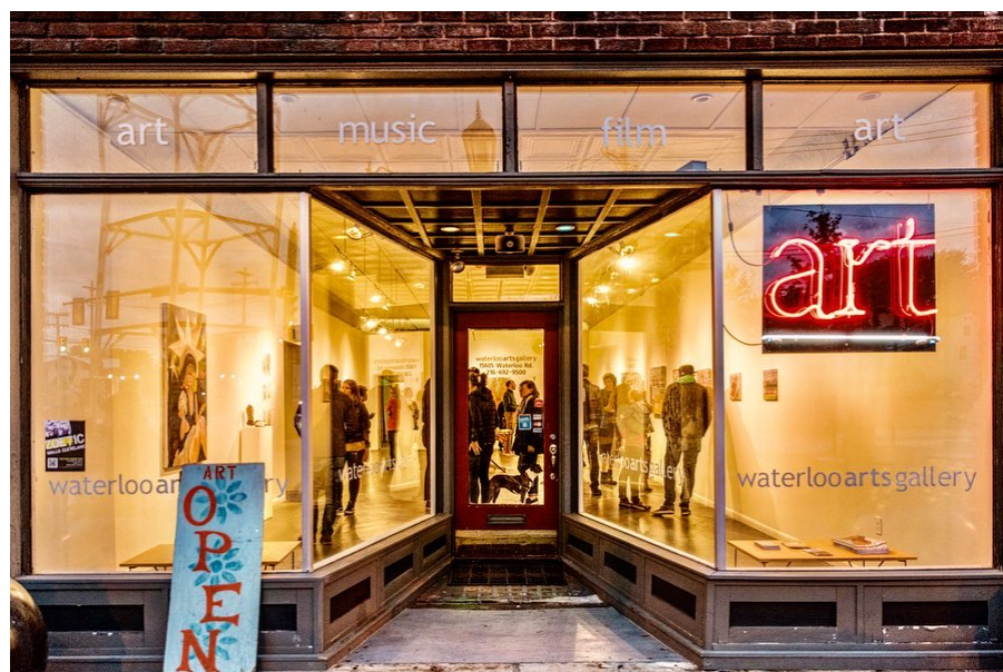
Opening reception (exterior), Mirror, Mirror , 2019