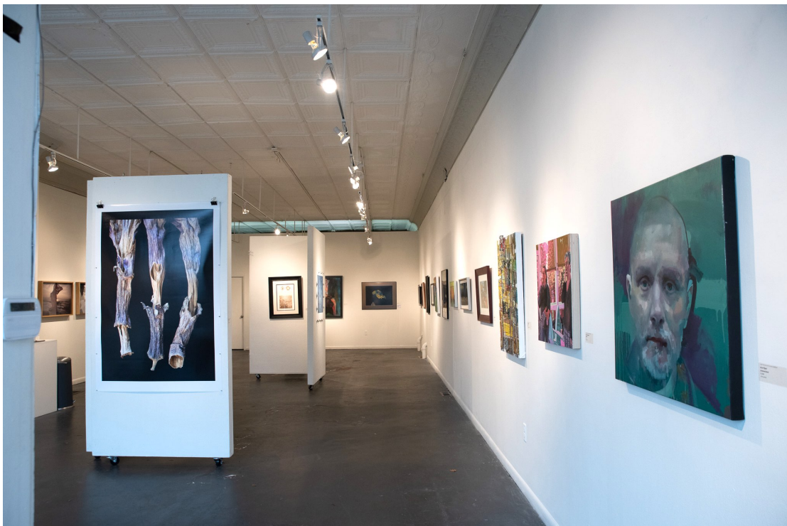
2020 Waterloo Arts Juried Exhibition