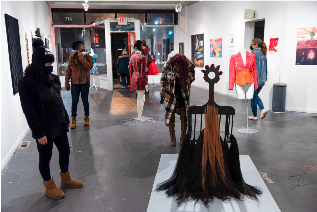
Opening reception, New Beginnings , 2021